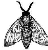
Figure 2: A sample black and white graphic (.eps format) that has been resized with the epsfig command.